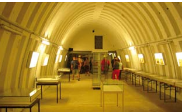
Exhibition at Kap Arkona Bunker, Rügen