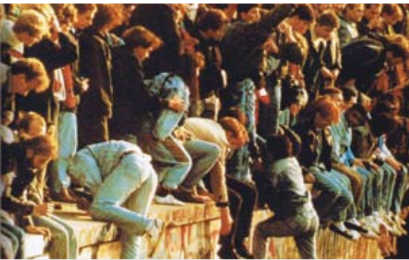
The Berlin Wall in November 1989