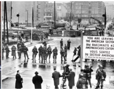
Checkpoint Charlie, 1961