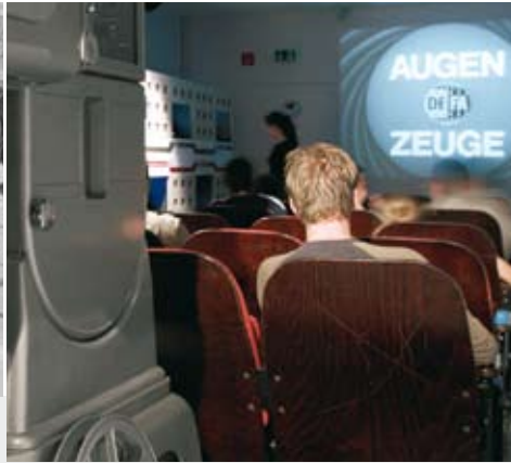
Left: Become an eye-witness in the DDR Museum, Berlin Above: Have a seat in an authentic Trabi in the DDR Museum, Berlin