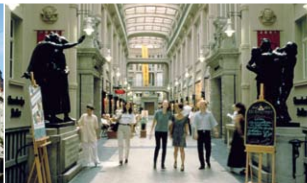
Mädler Passage in the heart of Leipzig