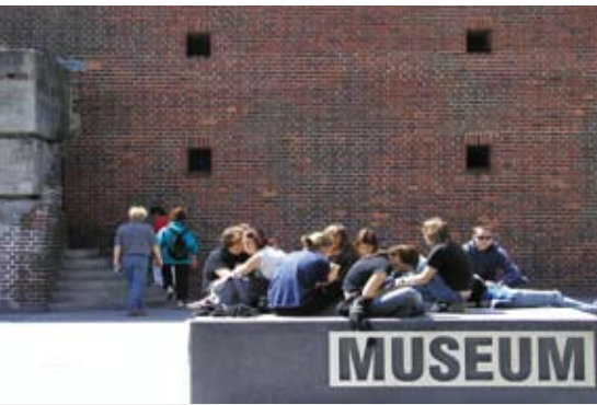
Museum entrance to the bunker control room at the HTI (Historical Technical Information Centre) Peenemünde