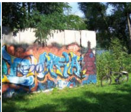
Above: Graffiti art on the "Mauerradweg", a bicycle path recreating the route of the Wall, Berlin Right: "Peaceful Revolution" in Leipzig