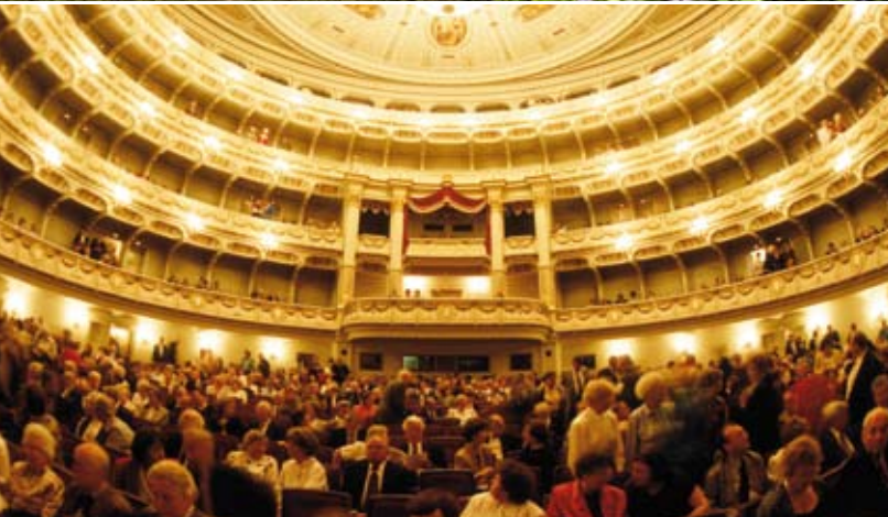
Above: Wartburg (The Castle on the Hill) in Eisenach / Top right: The chalk cliffs of Rügen Below: The Dresden Semper Opera House (Dresdner Semperoper)