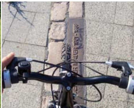
Above: Cycling tour through Berlin along the line where the Wall once stood / Right: Traffic in East Berlin