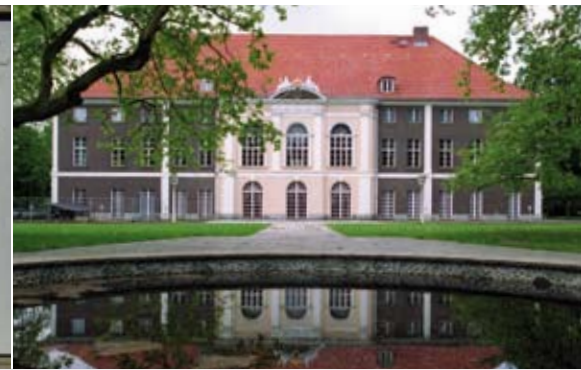
Schönhausen Castle (Schloss Schönhausen) in Berlin-Pankow