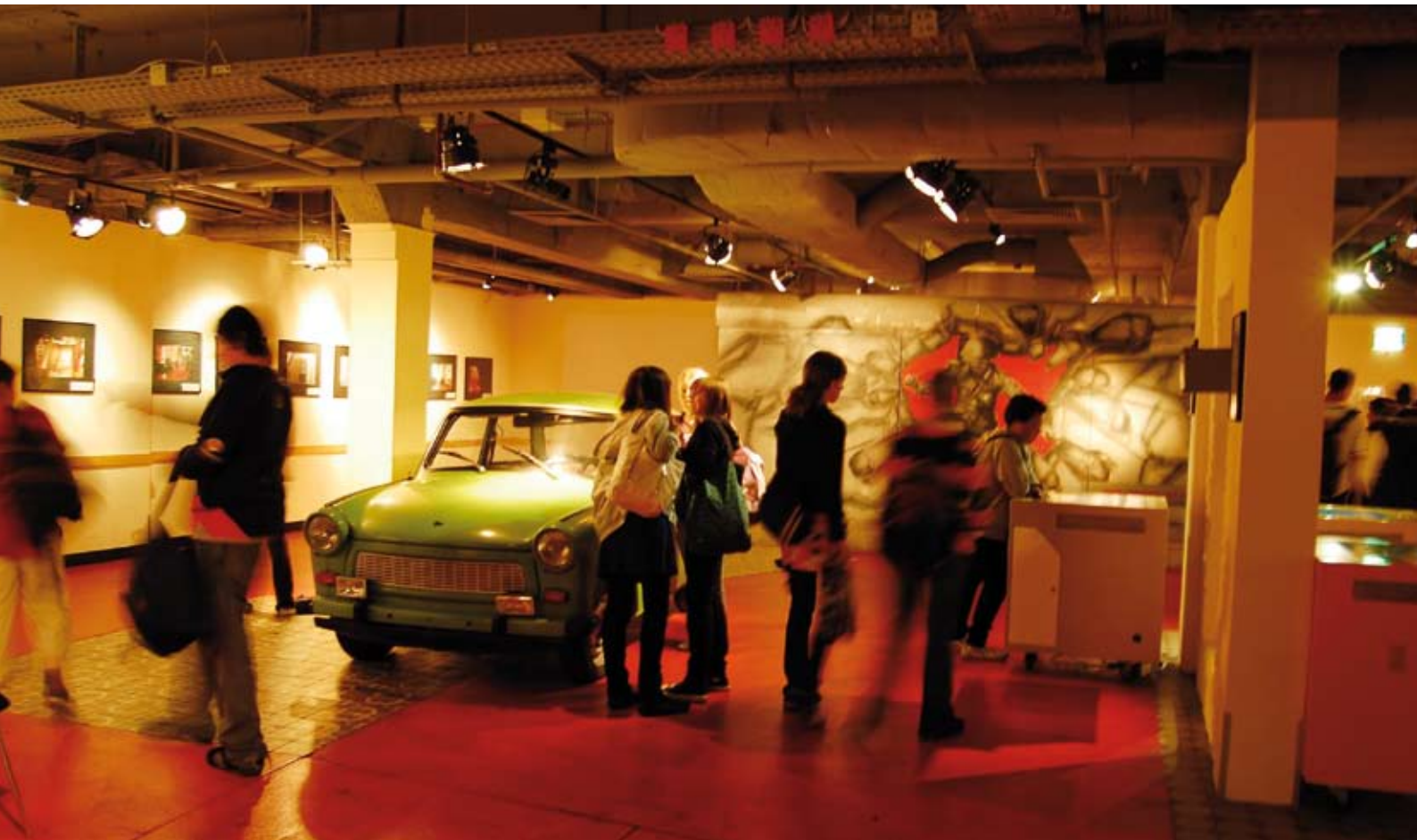
Foyer of the "Story of Berlin" museum