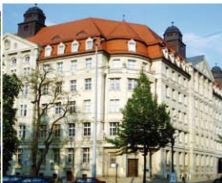
"Runde Ecke" (Round Corner) Museum, Leipzig