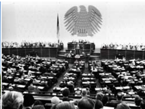
Government declaration by Federal Chancellor Konrad Adenauer in the Plenary Chamber on 20 October 1953