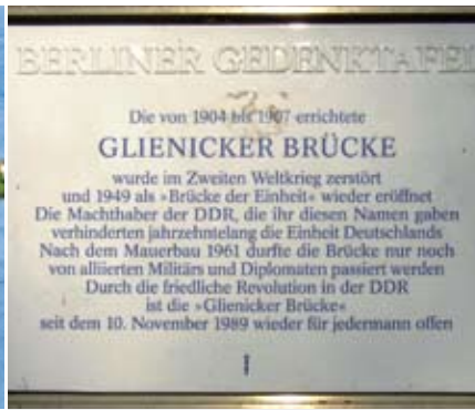
Commemorative plaque on Glienicke Bridge in Potsdam