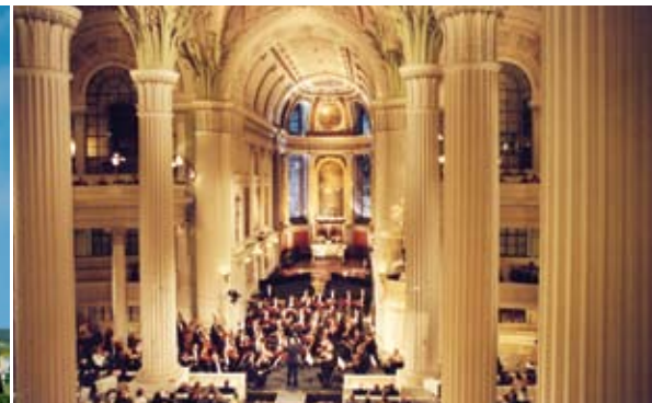
Far left: Glienicke Bridge in Potsdam Left: Statue at Schlosspark Sanssouci, Potsdam Above: Nave of St. Nicholas' Church in Leipzig