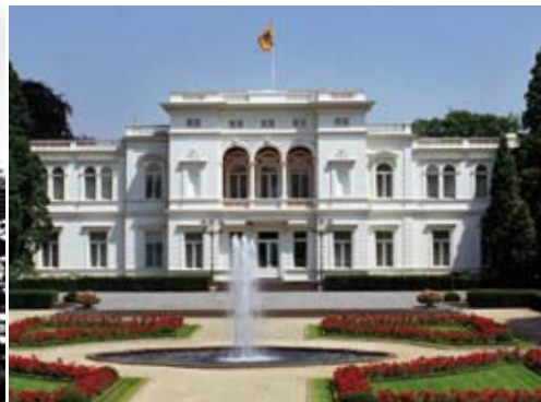
The Villa Hammerschmidt