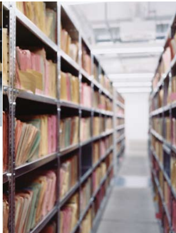
Above: A Stasi (State Security Service) member's desk / Right: Stasi files