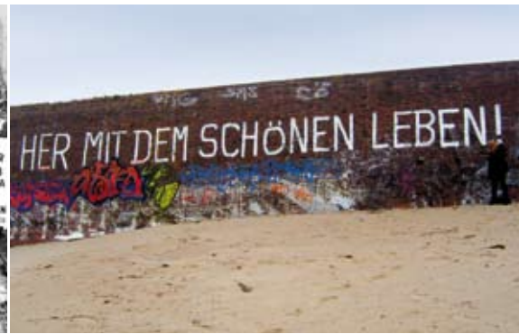
Above: The Prora Documentation Centre – Reminders on the beach Right: "Women of the rubble" – a professional group in the former GDR