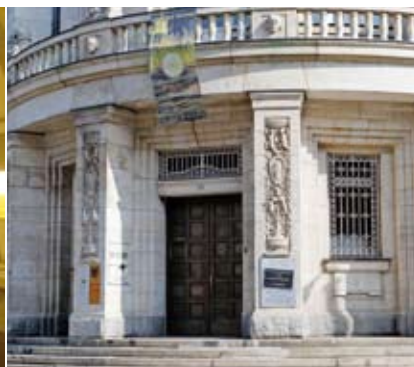
"Runde Ecke" (Round Corner) Museum in Leipzig