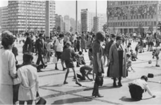
Alexanderplatz (Alexander Square), Berlin, in GDR times