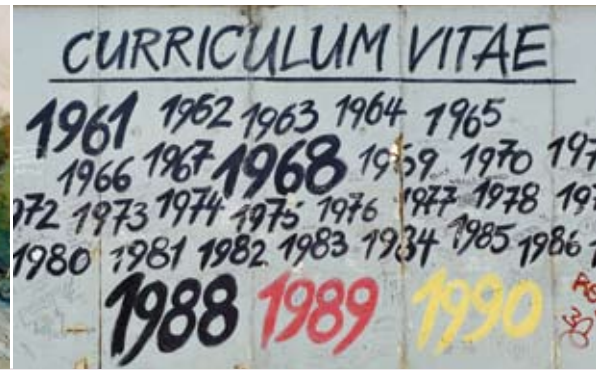
East Side Gallery