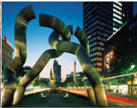
"Berlin" sculpture in Tauentzienstraße, Berlin