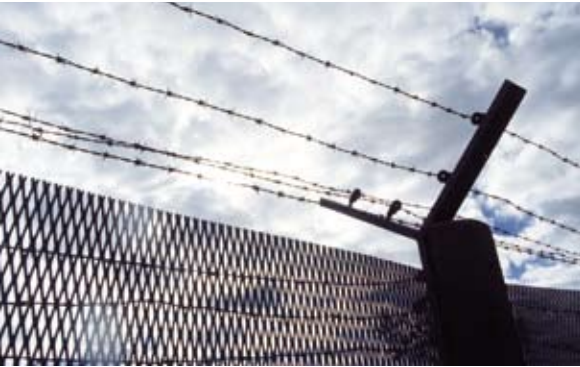
Above: Barbed wire at the inner-German border Right: Exhibition room at the HTI (Historical Technical Information Centre), Peenemünde