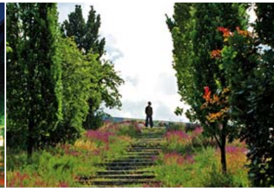
Wall Park (Mauerpark), Berlin

20 YEARS SINCE THE FALL OF THE WALL – A JOURNEY WHICH UNITES