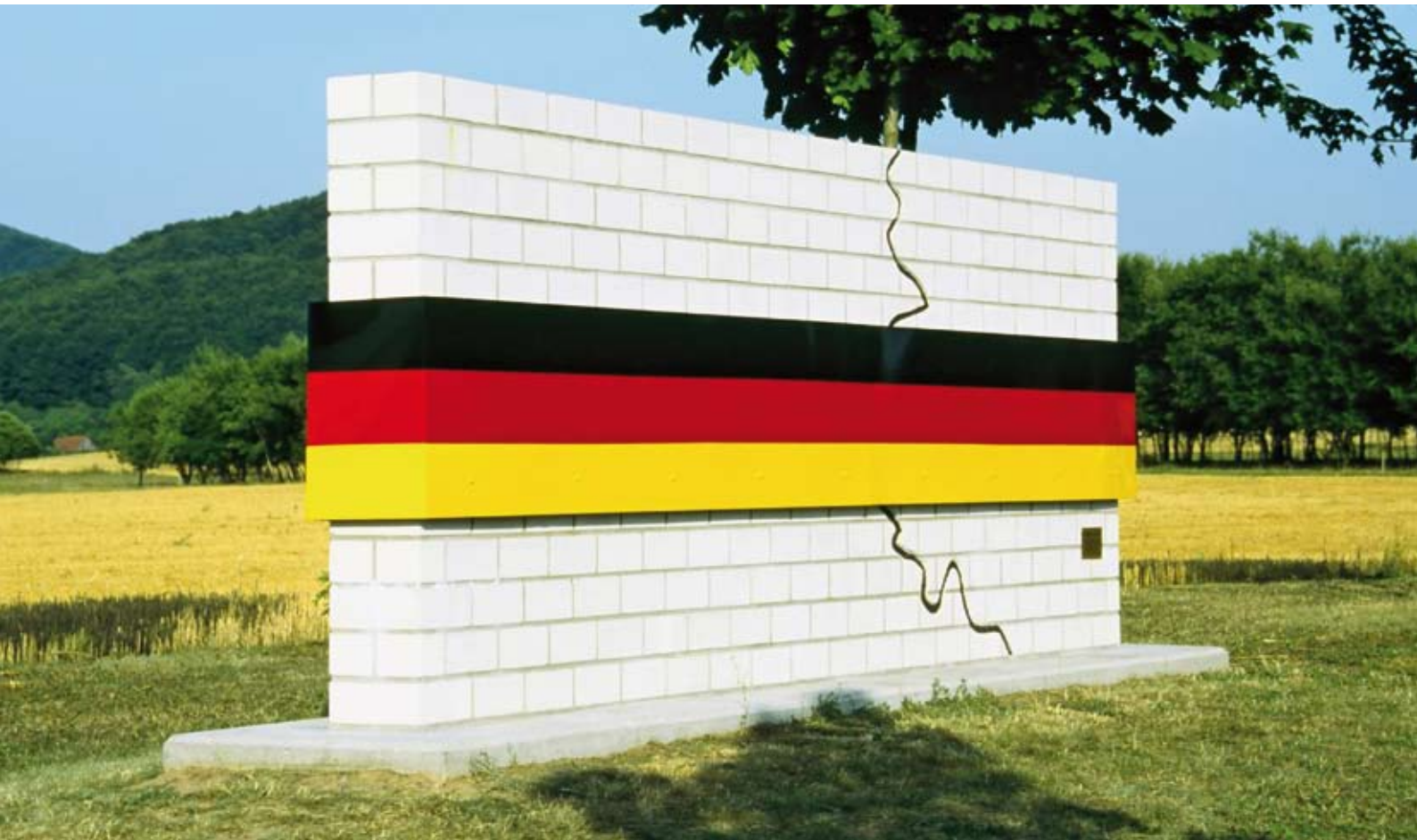
Memorial at "Schiffersgrund", Bad Soden – Allendorf