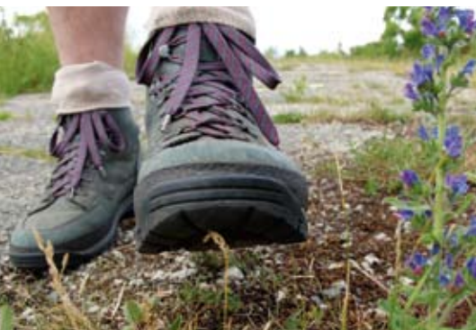
Hike along the green belt