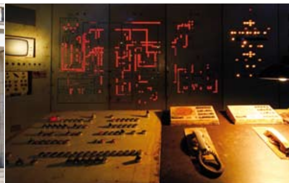
Technology in the Eichenthal Bunker