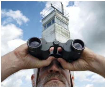
Left: Victoria Statue in Schwerin's Schlosspark Above: Observation tower (Grenzturn) at the green belt