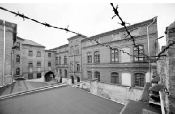
Above: Moritzplatz memorial in Magdeburg Right: Resting against a boundary stone Far right: Hiking in Thuringia