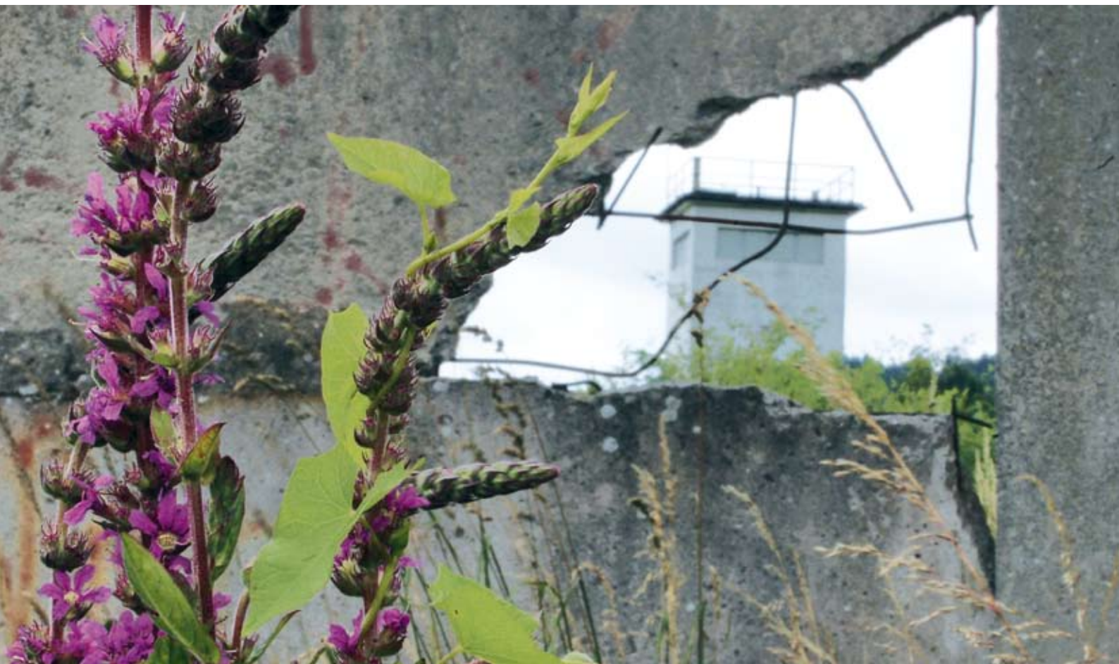
A glimpse of an observation tower through the Berlin Wall at the green belt