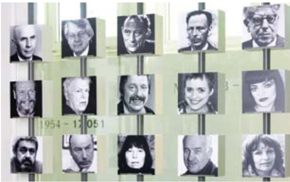
Above: Well-known refugees at the refugee transit camp, Berlin Right: Reichstag cupola, Berlin / Far right: "Parliament of Trees" memorial site where the Wall once stood