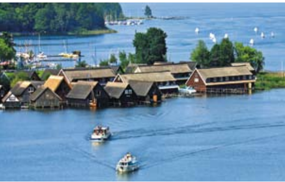
Mecklenburg Lake District