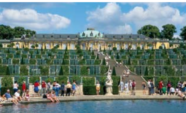
Schloss Sanssouci (Sanssouci Palace) in Potsdam