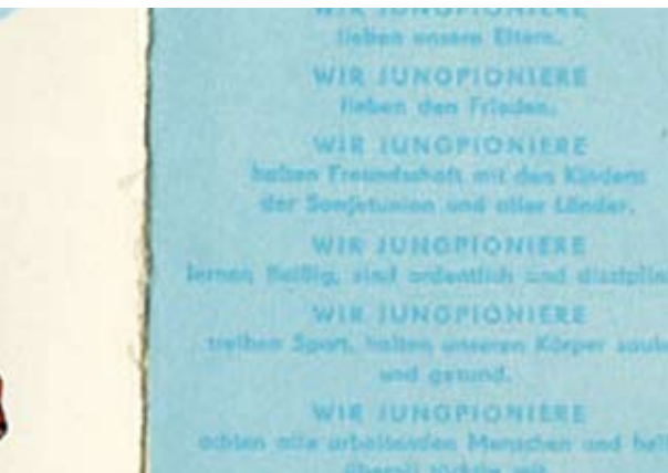
Identity card of a member of the Young Pioneers