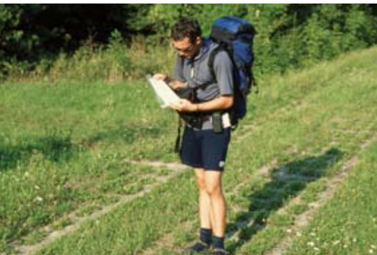
Hiking along the border trail