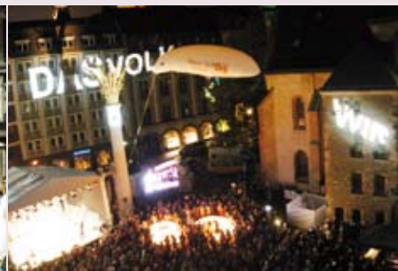
Memorials to the Fall of the Berlin Wall in Leipzig