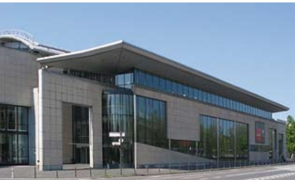
House of History (Haus der Geschichte) in Bonn